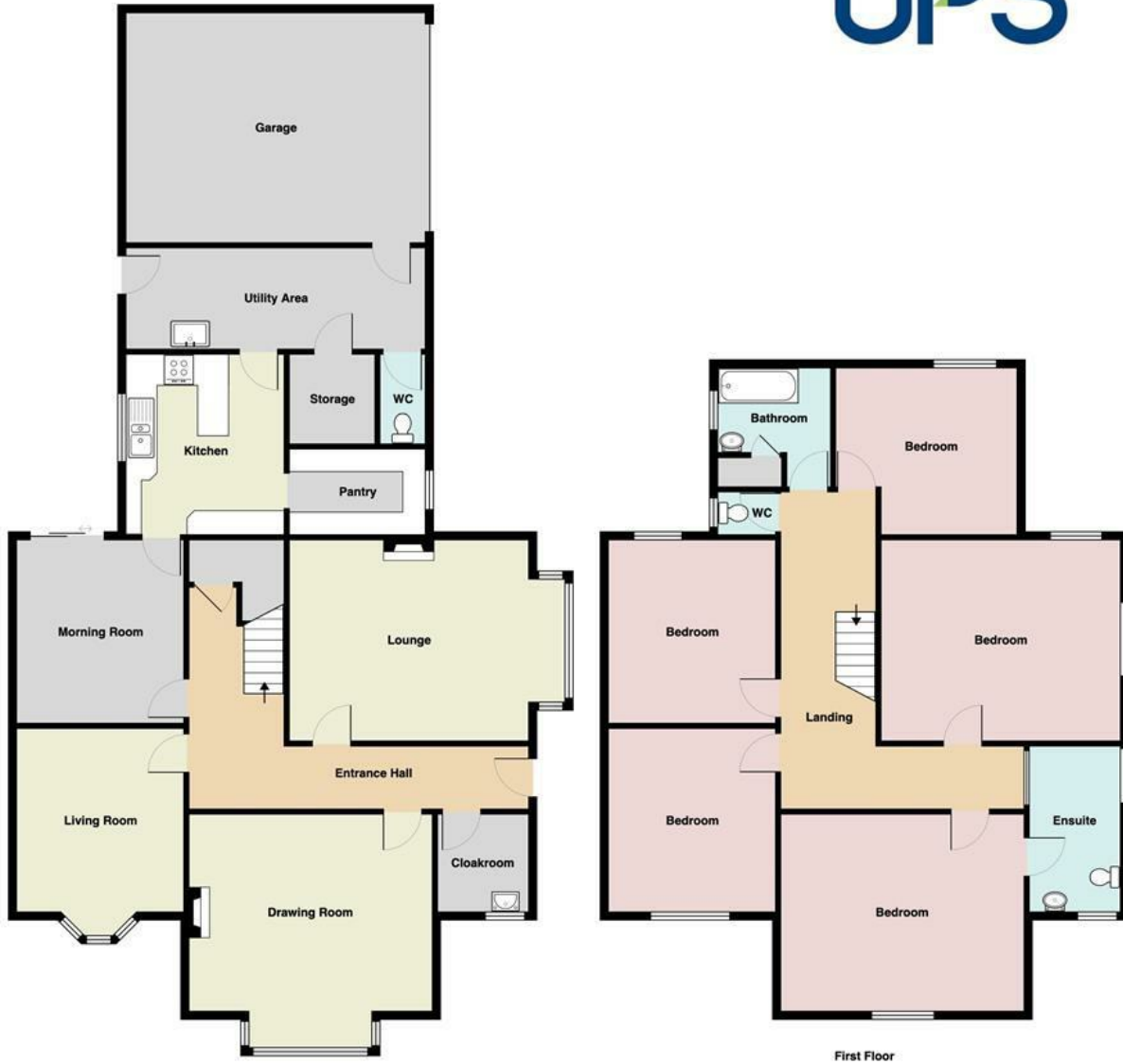
Total Area: 208.8 m 2 ... 2248 ft 2 (excluding garage, utility area, wc, storage) All measurements are approximate and for display purposes only

These particulars, whilst believed to be accurate are set out as a general outline only for guidance and do not constitute any part of an offer or contract. Intending purchasers should not rely on them as statements of representation of fact, but must satisfy themselves by inspection or otherwise as to their accuracy. No person in this firm's employment has the authority to make or give any representation or warranty in respect of the property.