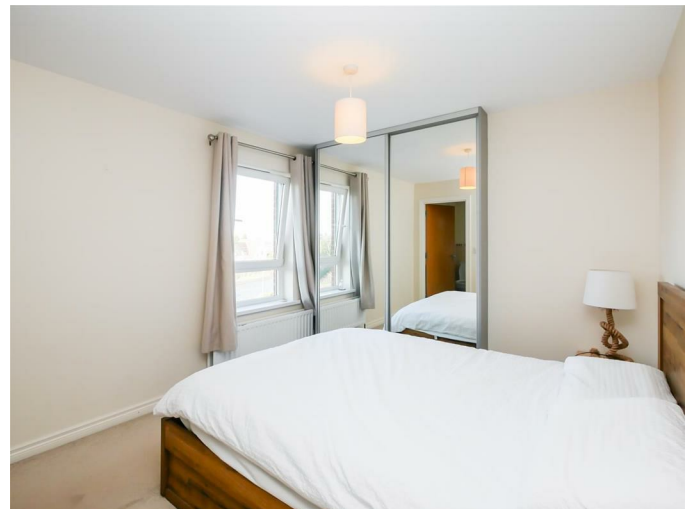
Bedroom 1 10'0" x 13'7" (3.07m x 4.15m )

(at widest points) Spacious double bedroom with built-in mirrored slide robes.