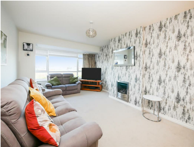
(at widest points) Spacious lounge with bay window