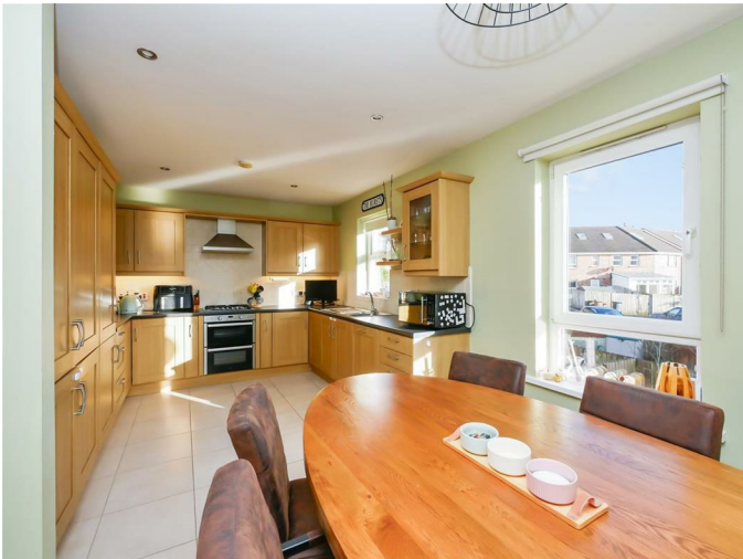
(at widest points) Modern fitted shaker style

kitchen with a selection of upper and lower level units complete with formica worktops, stainless steel sink with drainer, integrated electric oven with gas hob, over head extractor fan and tall fridge unit. Part tiled walls and tiled flooring. Recessed spotlights.