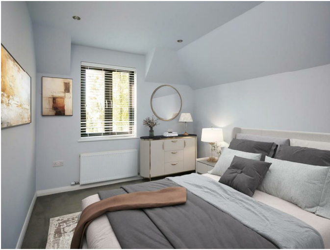
Bedroom One 11'5 x 10'1 (3.48m x 3.07m)