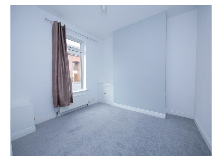
Living room 9'9 x 9'6 (2.97m x 2.90m)