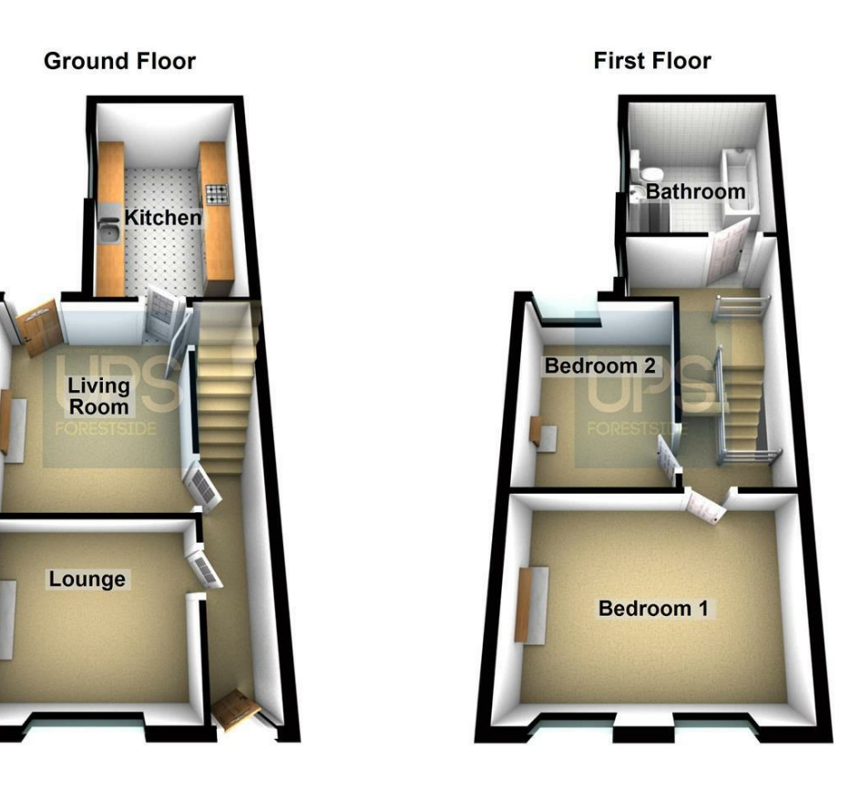
Please note this floor plan is for marketing purposes only, is not to scale and is to be used as a guide only. No liability is accepted in respect of any consequential loss arising from the use of this plan. Plan produced using PlanUp.