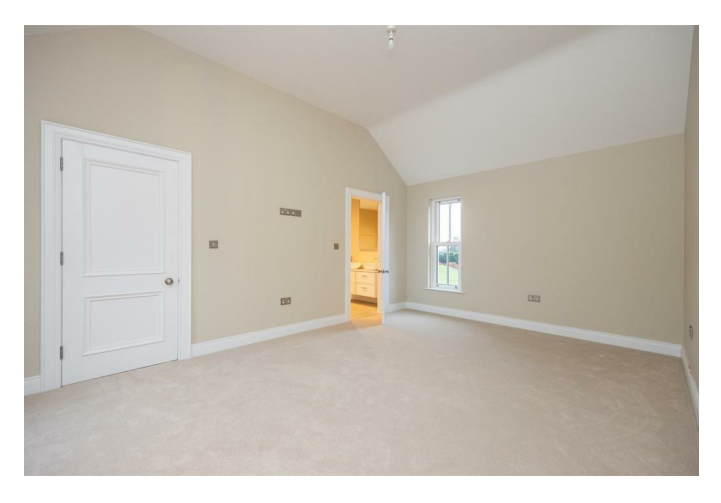
Dressing area 9'6 x 7'2 (2.90m x 2.18m)

Master Bedroom 18'9 x 12'1 (5.72m x 3.68m)