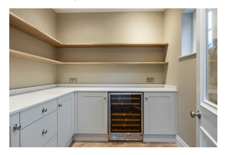
Wine cooler and wine rack, Solid Oak floating shelves

Utility Room 10'0 x 8'3 (3.05m x 2.51m) Living Room 18'0 x 18'0 (5.49m x 5.49m)