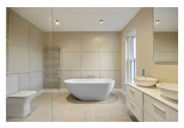
Bedroom Two 13'6 x 11'6 (4.11m x 3.51m) En-Suite 10'0 x 3'9 (3.05m x 1.14m) First floor