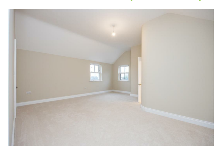
En-Suite 10'0 x 3'9 (3.05m x 1.14m) Bedroom Four 18'3 x 18'0 (5.56m x 5.49m) At widest points

En-Suite 7'4 x 6'6 (2.24m x 1.98m ) Outside