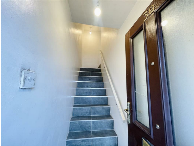
Composite front door. Steps to first floor.