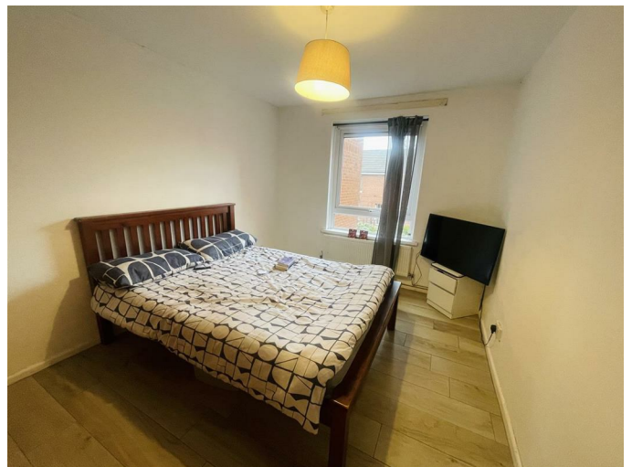
Wood effect tiled flooring and built in storage.