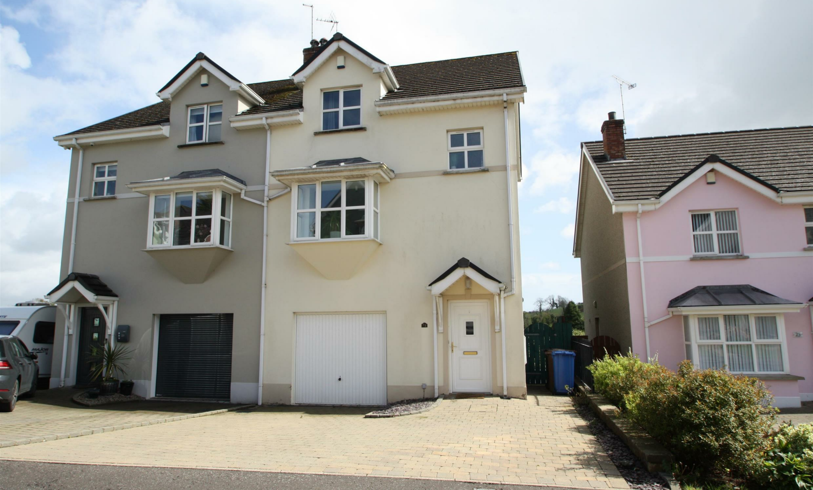
27 TODD'S HILL PARK, SAINTFIELD, DOWN, BT24 7FB