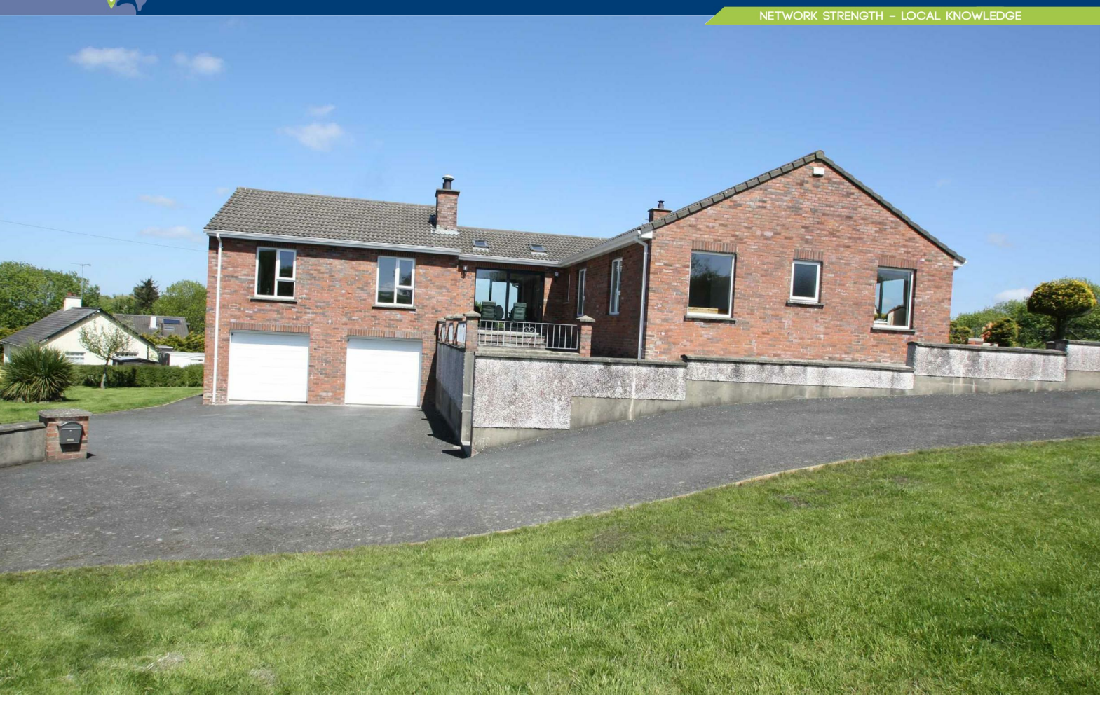
48 BAWN HILL ROAD, BURREN, BALLYNAHINCH, DOWN, BT24 8LD