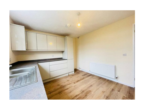
6 Renagh Park Rathfern, Newtownabbey, BT36 6BS