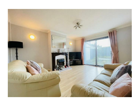
26 Ardeen Avenue Rathcoole, Newtownabbey, BT37 9AJ