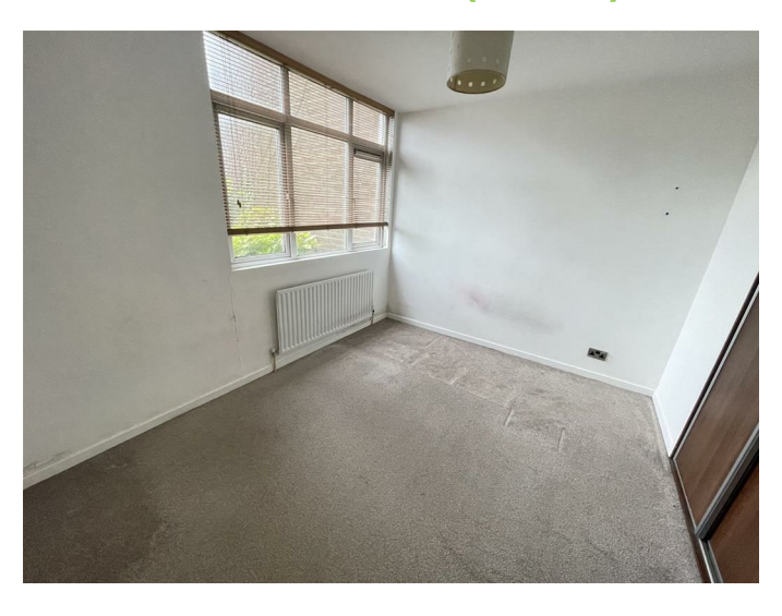
BEDROOM TWO 10'5" x 8'2" (3.2 x 2.5)