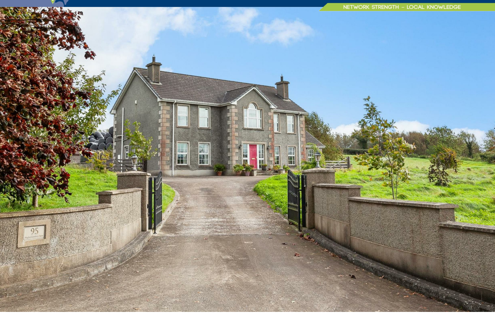
95 DRUMLOUGH ROAD, ANNAHILT, HILLSBOROUGH, DOWN, BT26 6PU